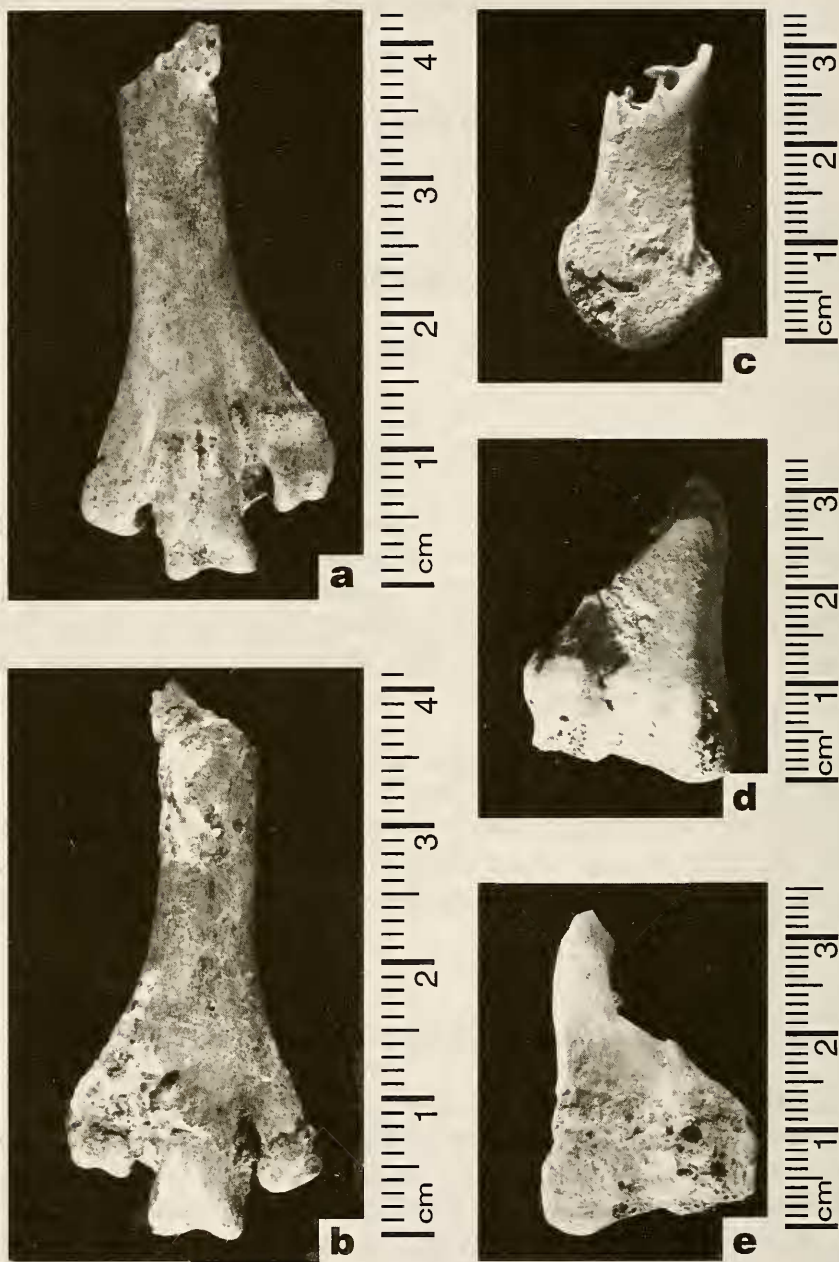
Fig. 1. Otis aff. khosatzkii : tarsometatarsus sin. dist., NMNHS 142 - cranial view (a) and caudal view (b); femur dex. dist., NMNHS 156 - medial view (c), cranial view (d) and caudal view (e)